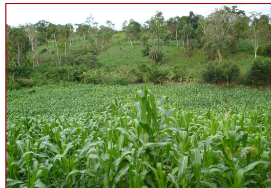
The campus grounds were cleared of the scrub growth and replaced with corn, which has already matured. The harvest will have future food value for the children and the community.