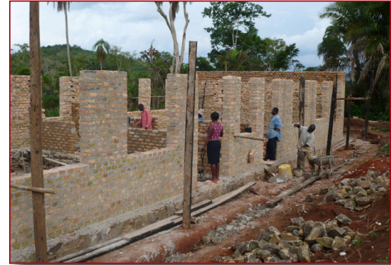
Bricklayers on the orphanage project have made fantastic progress since setting the foundation in August, 2008. The profile of the first building on the campus, the kindergarten classroom, is shown at the top of page, and above.